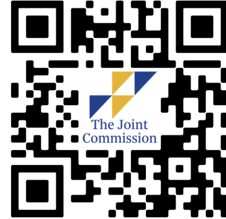
Integrating Sustainability into Quality Agenda